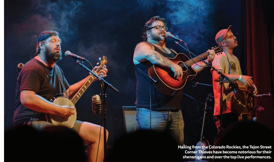
Hailing from the Colorado Rockies, the Tejon Street Corner Thieves have become notorious for their shenanigans and over the top live performances.

join us at 5:45 p.m. for a dance class prior to the show!