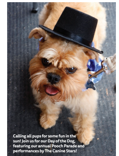
Calling all pups for some fun in the sun! Join us for our Day of the Dog, featuring our annual Pooch Parade and performances by The Canine Stars!

Colorado-based Canine Stars! will perform their award-winning Stunt Dog Show three times during our day dedicated to our furry friends. They recently appeared on the Season 16 premiere of America's Got Talent , with judge Howie Mandel calling them the “best animal act” he had ever seen.