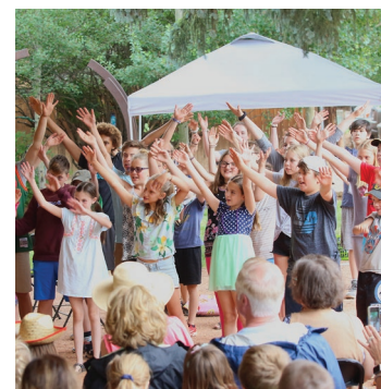
Green Box Arts Camps encourage hundreds of children to hone their creative skills, inspired by the surrounding natural environment!

Imagine: musicians, writers, theater directors, and choreographers all taking in a group of talented, wacky high school students for 48 HOURS to create a musical! We are looking for multi-talented, incredibly driven high school students who can do one or more of the following: write, play an instrument, sing, act, organize, or create. You will be given an opportunity to do what you love, but you will also be asked to step in and do whatever needs to be done to get this production up – all on a minimal amount of sleep! This camp is open for students entering 10 th – 12 th grades, along with graduates from the class of '22.