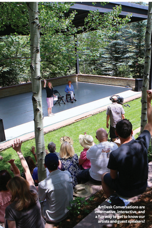
ArtDesk Conversations are informative, interactive, and a fun way to get to know our artists and guest speakers!

Bring your pooch and join us for costumes, prizes and fun as we parade around Gazebo Lake! Visit greenboxarts.org for prize categories and to register for this pooch-perfect event.