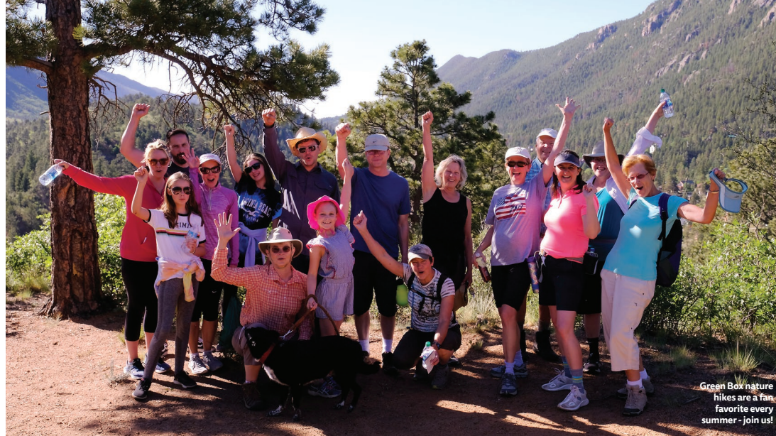
Green Box nature hikes are a fun favorite every summer - join us!

*ARTDESK CONVERSATIONS ARE FREE AND INCLUDE LUNCH; REGISTRATION IS REQUIRED DUE TO LIMITED CAPACITY.