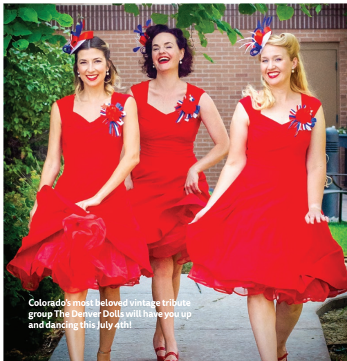
Colorado's most beloved vintage tribute group The Denver Dolls will have you up and dancing this July 4th!

*Following the concert, join us around Gazebo Lake Park as we launch water lanterns designed throughout the festival. A fitting end to Independence Day and the 14th annual Green Box Arts Festival.