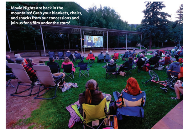
Movie Nights are back in the mountains! Grab your blankets, chairs, and snacks from our concessions and join us for a film under the stars!

Join us under the stars as Rocky Mountain Women's Film presents two evenings of fun, family-friendly cinematic joy: Los Hermanos on June 22 and An Evening of Shorts , including a Youth Documentary Academy film and featuring Gramma & Ginga and My Indiana Muse on June 29. Concessions for sale and please bring your own blanket/chair.