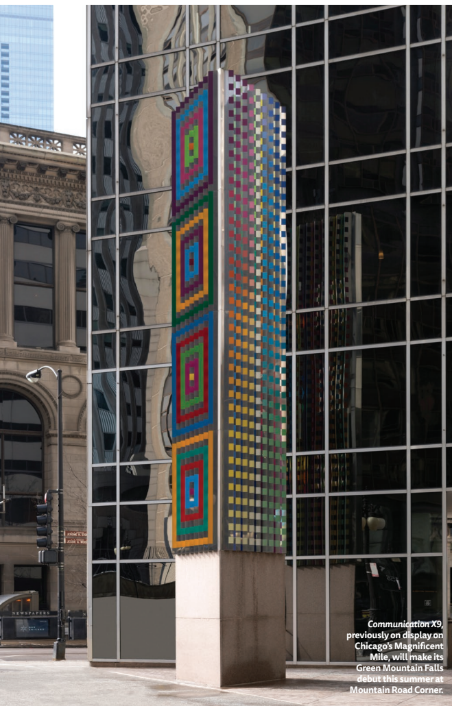
Communication X9 , previously on display on Chicago's Magnificent Mile, will make its Green Mountain Falls debut this summer at Mountain Road Corner.