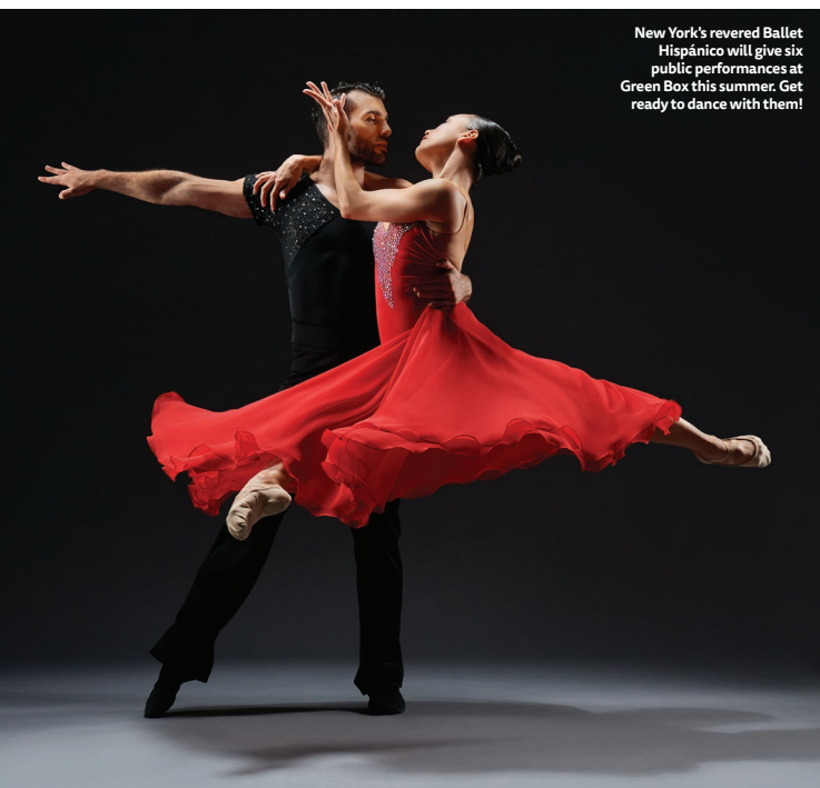
New York's revered Ballet Hispanico will give six public performances at Green Box this summer. Get ready to dance with them!

For events held outside, early arrival recommended. Bring your own chairs, blankets, etc.