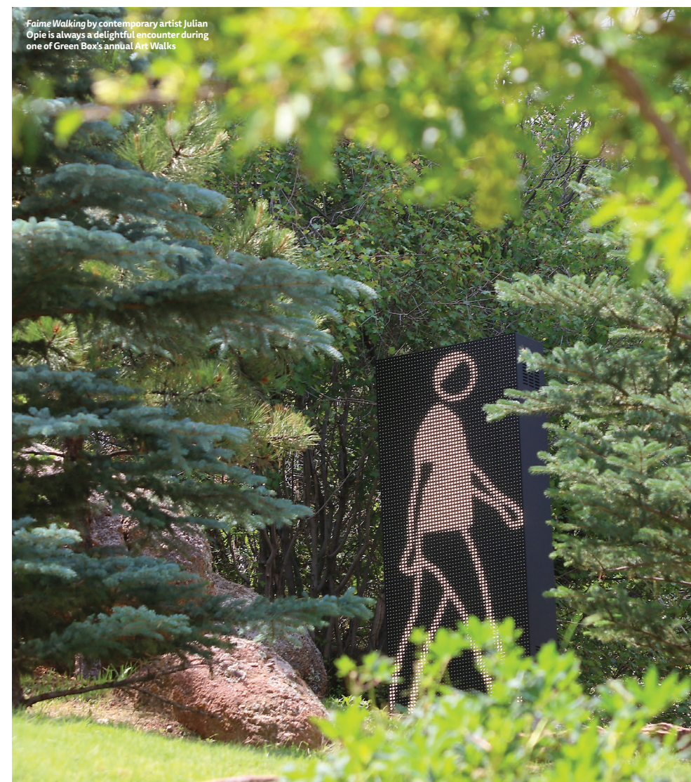
Faime Walking by contemporary artist Julian Opie is always a delightful encounter during one of Green Box's annual Art Walks