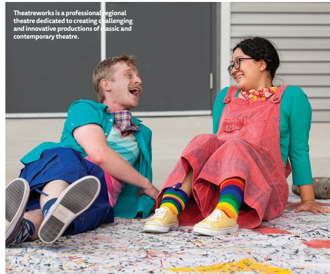
Theatreworks is a professional regional theatre dedicated to creating challenging and innovative productions of classic and contemporary theatre.

A day for the whole family including puppet shows from a myriad of creators, build your own puppet workshops, and even a puppet museum!