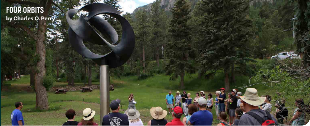
FOUR ORBITS by Charles O. Perry