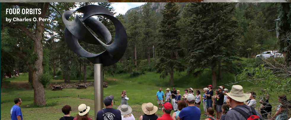
FOUR ORBITS by Charles O. Perry